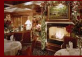
The Overlook Room seats 30-50 guests with a private bar.