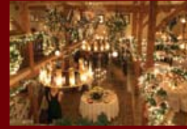
The Great Hall seats up to 200 guests.

WE'RE ALL SET TO ASSIST YOU WITH THE PICTURE PERFECT SETTING!