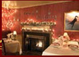
Our private dining rooms seat 10-25 guests.