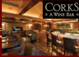
Corks, our wine bar, seats 20-30 guests.